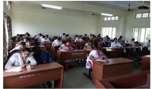
Fig. Students participated in essay writing competition